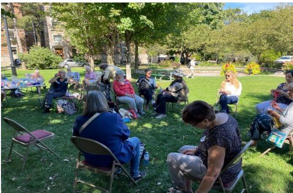
Knit in the Park

The Toronto Branch has been providing new articles to immigrants and low-income Torontonians, through front line social service agencies since 1892 . Our financial base is derived solely through monetary donations given by our 300 active members, corporations, service clubs, foundations, bequests and memorials. We are a registered Canadian Charity and tax receipts are issued for donations of at least $10.