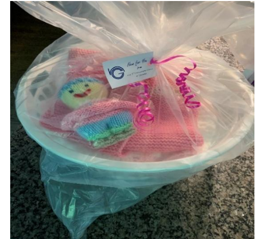
A completed Layette ready to give to baby

Our work is accomplished entirely by volunteers. We have no fixed address, but are generously provided space for our Annual General Meeting and other NGC events at Yorkminster Park Baptist Church. Sincere thanks to the Dorcas Group, our oldest unit, formed in 1927, for their gracious hospitality. Members volunteer to assist in sorting and packing donations for our annual Distribution Day in November when we allocate items to the various agencies we support.