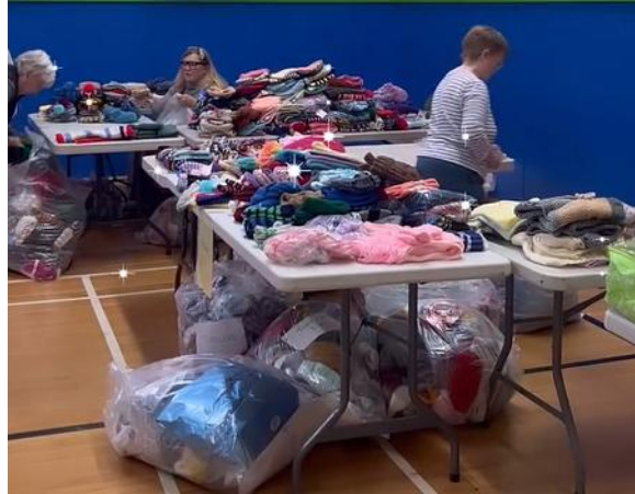
Shopping and packing for an Agency on Distribution Day

Members agree to donate at least 2 new items each year and/or make a financial donation, to enable our Purchasing Co-ordinator to purchase additional items.