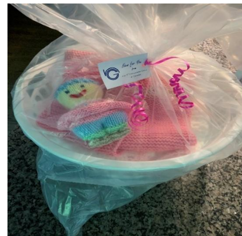
A completed Layette ready to give to baby

Our work is accomplished entirely by volunteers. We have no fixed address, but are generously provided space for our Annual General Meeting and other NGC events at Yorkminster Park Baptist Church. Sincere thanks to the Dorcas Group, our oldest unit, formed in 1927, for their gracious hospitality. Members volunteer to assist in sorting and packing donations for our annual Distribution Day in November when we apportion items to the various agencies we support.