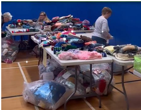
Shopping and packing for an Agency on Distribution Day

Members agree to donate at least 2 new items each year and/or make a financial donation, to enable our Purchasing Co-ordinator to purchase additional items.