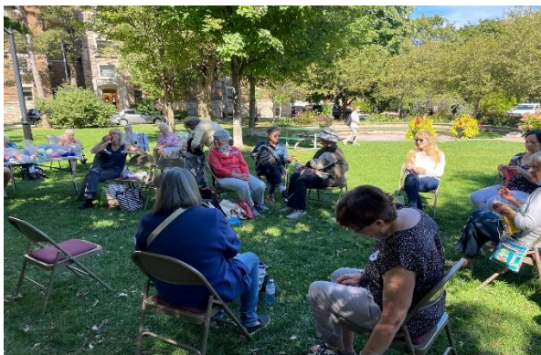
Knit in the Park

The Toronto Branch has been providing new articles to immigrants and low-income Torontonians, through front line social service agencies since 1892 . Our financial base is derived solely through monetary donations given by our 300 active members, corporations, service clubs, foundations, bequests and memorials. We are a registered Canadian Charity and tax receipts are issued for donations of at least $10.